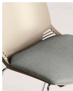
Detail of cushion

Finishes and colors available in the LAS Colors Samples Card.